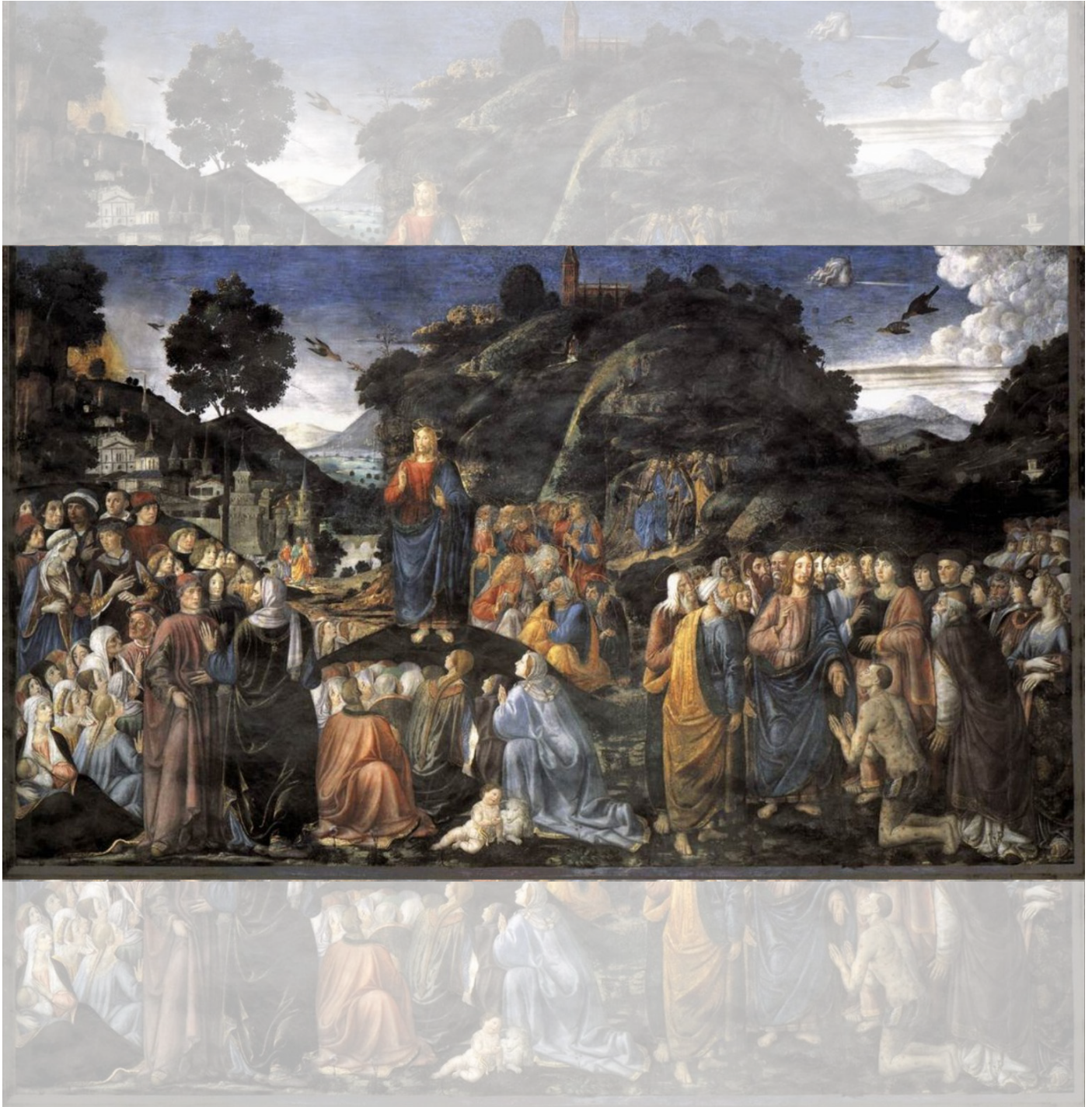
The Sermon on the Mount, by Cosimo Roselli

This is God's house. There is a place for you here. Welcome home.