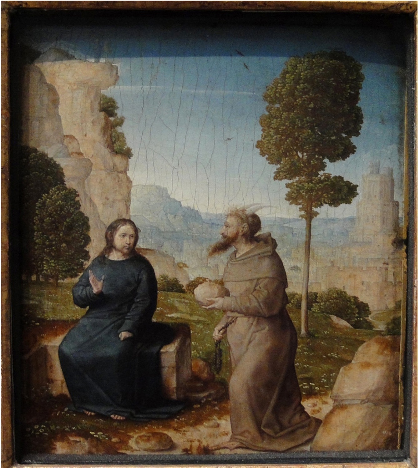
Jesus and the Tempter, Juan de Flandes

The First Sunday in Lent • February 26, 2023 • 10:30 am