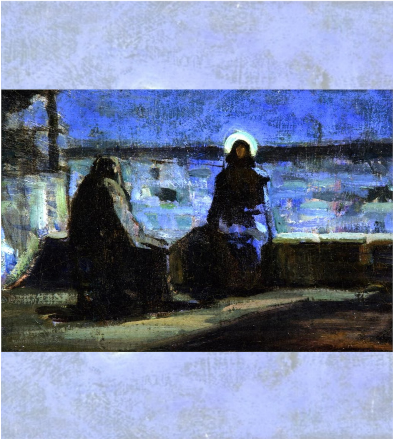
Study for Nicodemus Visiting Jesus, Henry Ossawa Tanner

The Second Sunday in Lent • March 5, 2023 • 10:30 am