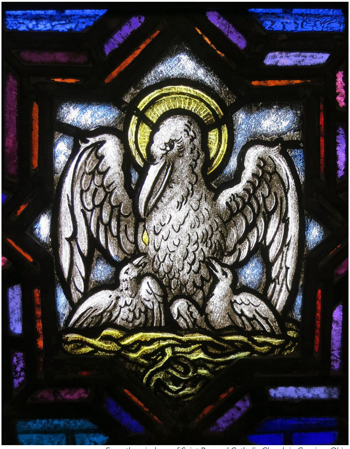
From the windows of Saint Bernard Catholic Church in Corning, Ohio